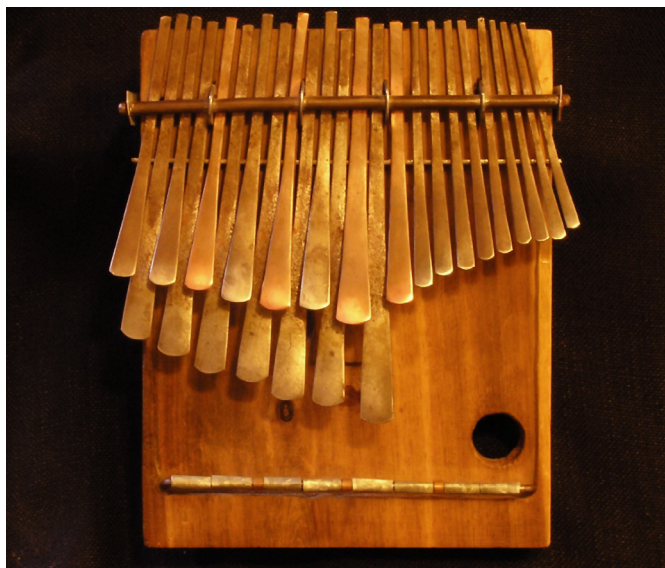
A Zimbabwean mbira dza vadzimu.