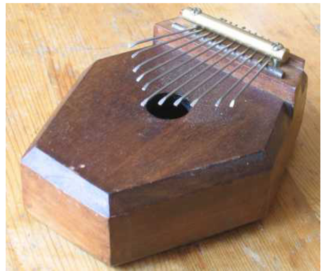
A sanza.

Some lamellophones are mounted on a sound box. A sound box is a hollow box used to amplify, or increase the volume, of musical instruments. Traditional mbira players use a halved calabash gourd to amplify the sound. To learn more about the cultural history of the mbira and to hear it being played, check out this video 1 .