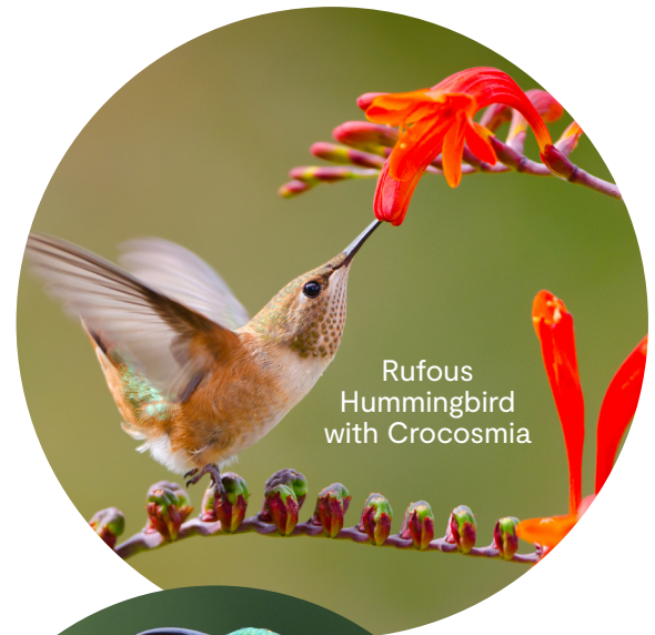
Rufous Hummingbird with Crocosmia