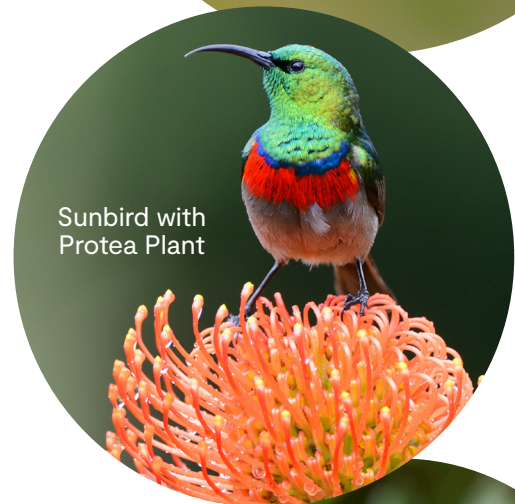
Sunbird with Protea Plant