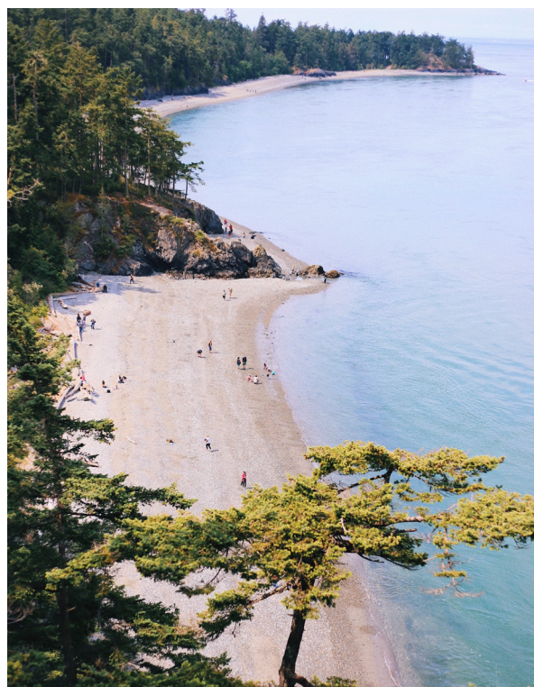
Deception Pass, WA