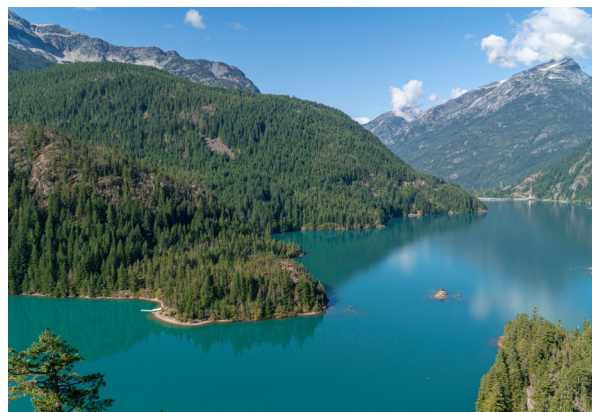
Diablo Lake, WA