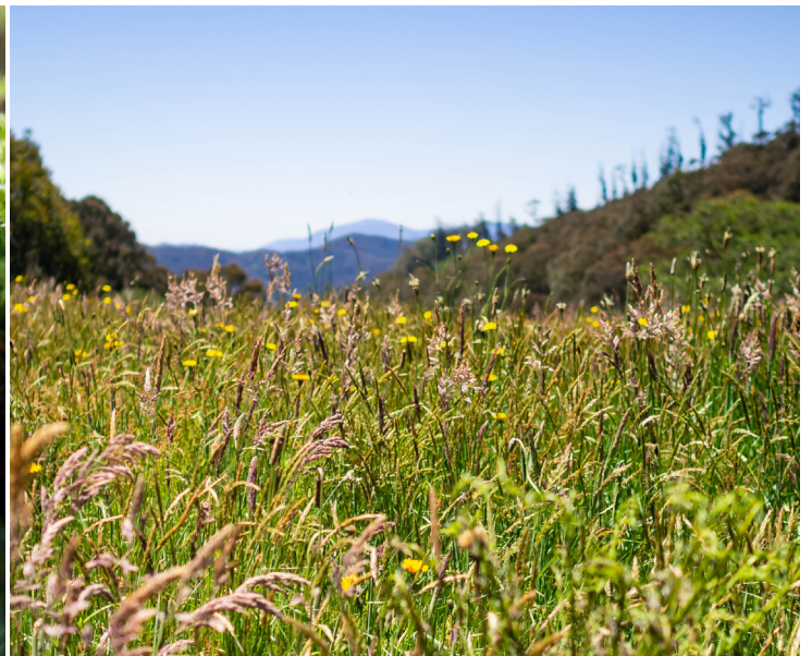
Field or meadow