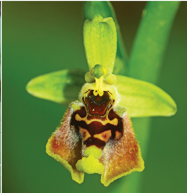
Bed Orchid (another example of co-evolution).