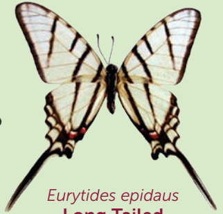
Eurytides epidaus Long Tailed Kite Swallowtail ●