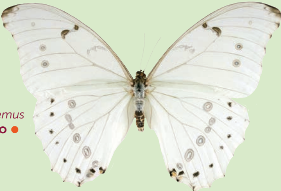
Morpho polyphemus White Morpho ●