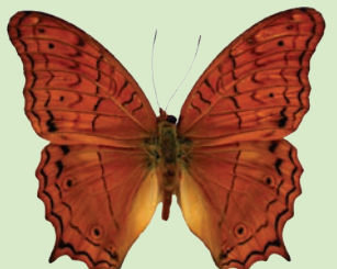
Vindula dejone Cruiser ●