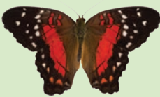
Anartia amathea Scarlet Peacock ●