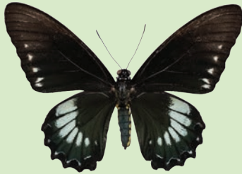
Battus belus Belus Gold Rim ●