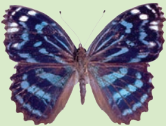
Myscelia ethusa Royal Blue ●