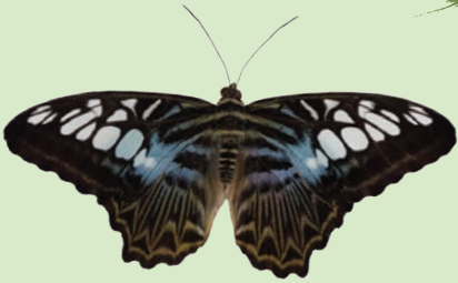
Parthenos sylvia Clipper ●