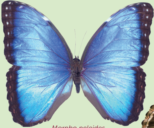
Morpho peleides Common Blue Morpho ● (inside & outer wings)

Look for these large butterflies on our fruit dishes or chasing each other through the trees. Most have eye spots, some have brilliant inner wings.