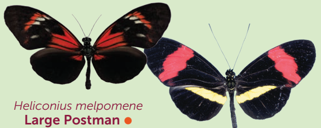
Heliconius melpomene Large Postman ● (Suriname & Costa Rica)

These butterflies get protein by eating pollen. This gives them a longer lifespan than most other butterflies.