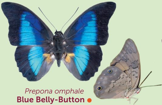
Prepona omphale Blue Belly-Button ● (inside & outer wings)

All of our butterflies come from sustainable farms around the world.