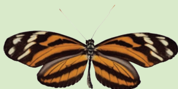
Heliconius ismenius Tiger Longwing ●