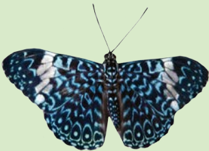
Hamadryas amphinome Red Calico ●