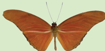
Dryas julia Julia ●