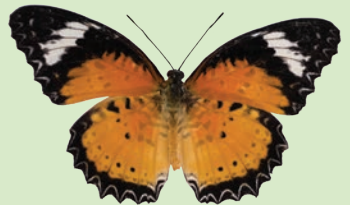
Cethosia cyane Leopard Lacewing ●