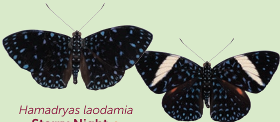
Hamadryas laodamia Starry Night ● (male & female)