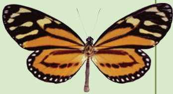
Lycorea cleobaea Tiger Mimic ●