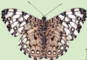
Hamadryas feronia Variable Calico ●