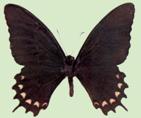
Papilio erostratus Dusky Swallowtail ●