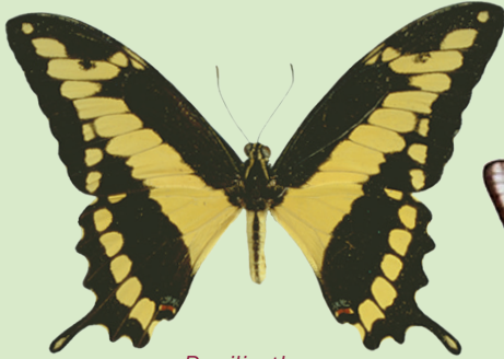
Papilio thoas King Swallowtail ●

Some of these have tails on their wings, some don't but their profiles are still quite distinctive.