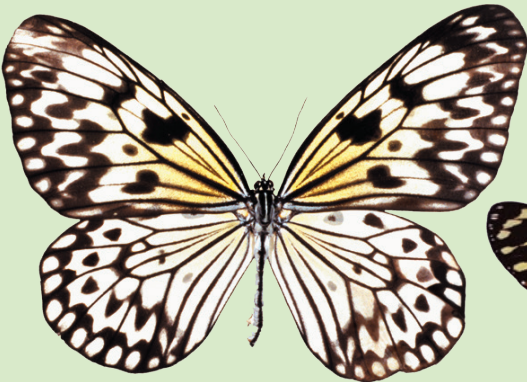
Idea leuconoe Paper Kite ●

Caterpillars of this group eat plants that are nasty tasting to most other animals. The chemicals in the plants are also in the butterflies' bodies and make them unpleasant for predators.