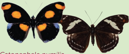
Catonephele numilia Numilia ● (male & female)