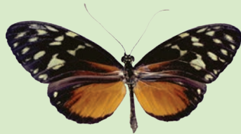
Heliconius hecale Golden Helicon ●