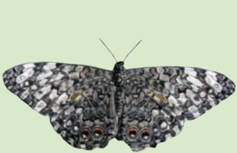
Hamadryas februa Gray Calico ●