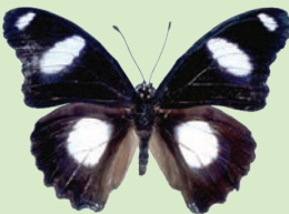
Hypolimnas bolina Blue Moon ●