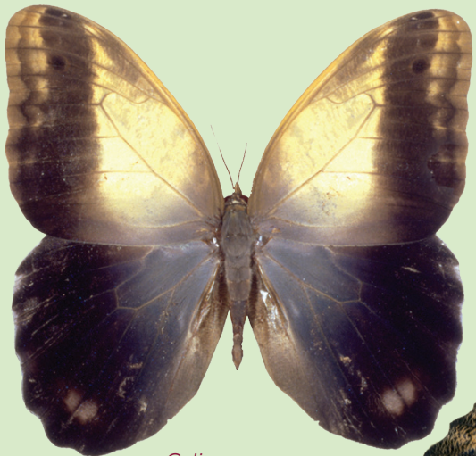
Caligo memnon Owl Butterfly ● (inside & outer wings)